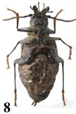
Figs 1-8. Pogonarthron (s. str.) tschitscherini tschitscherini :

1- male, holotype; 2 - holotype labels; 3-4 - males, Ozgur environs southwards Osh; 5-7 - females, same locality, dorsal view; 8 - female, same locality, ventral view.