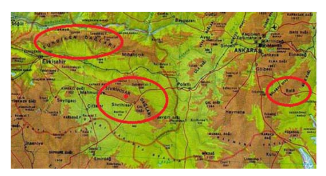
Fig. 2. Distribution patterns of Dorcadion semibrunneum semibrunneum (Sündiken Mountains, Bozdağ), D. semibrunneum sivrihisarense ssp. n. (Sivrihisar Mountains, Paşakadın village marked with a dot) and D. semibrunneum notatum (Küre Mountains, env. Bala)