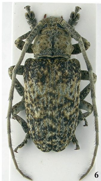
Fig. 5 – Agapanthia fadli n.sp. Paratype male. Fig. 6 – Crossotus tamer n.sp. Holotype male.