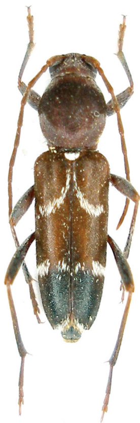
Figure 1. Chlorophorus grosseri n. sp. holotype female.