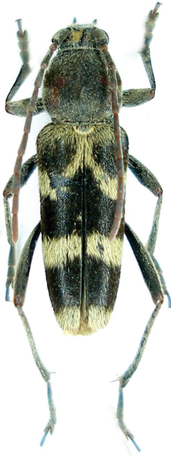
Figure 3. Chlorophorus oezdikmeni n. sp. holotype male.