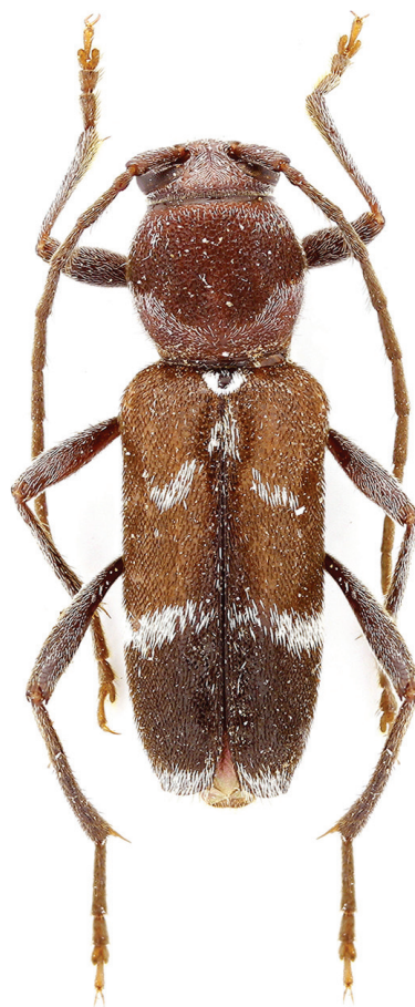
Figure 2. Chlorophorus grosseri n. sp. paratype male.

Ventral side of body brownish-black, meso- and metepisterna, base of the metasternum and base of the first and second visible sternites densely clothed with contrasting white pubescence. Antennae reddish-brown, short, hardly extending to the middle of elytra, third to fifth joints sparsely clothed with erect hairs on latero-ventral surface. Front legs reddish brown, middle femora with claws blackish, hind legs black.